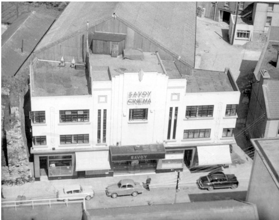
30. The Savoy Cinema as seen from a crane. 1960.