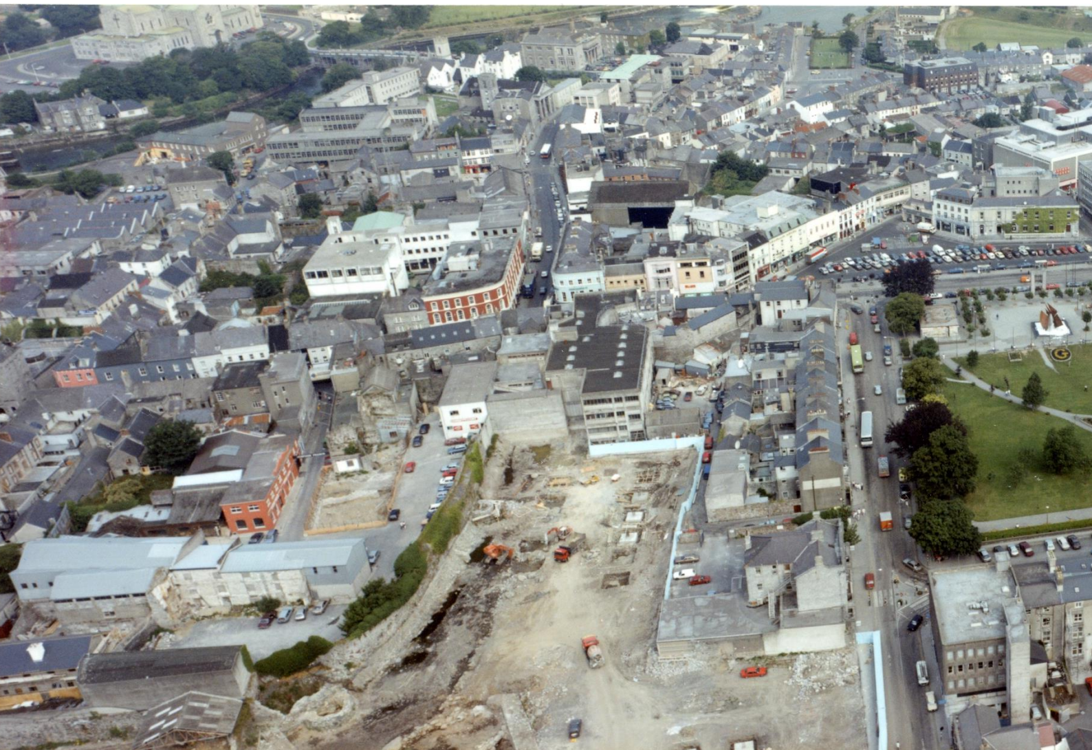
4. A panorama of the city c.1988