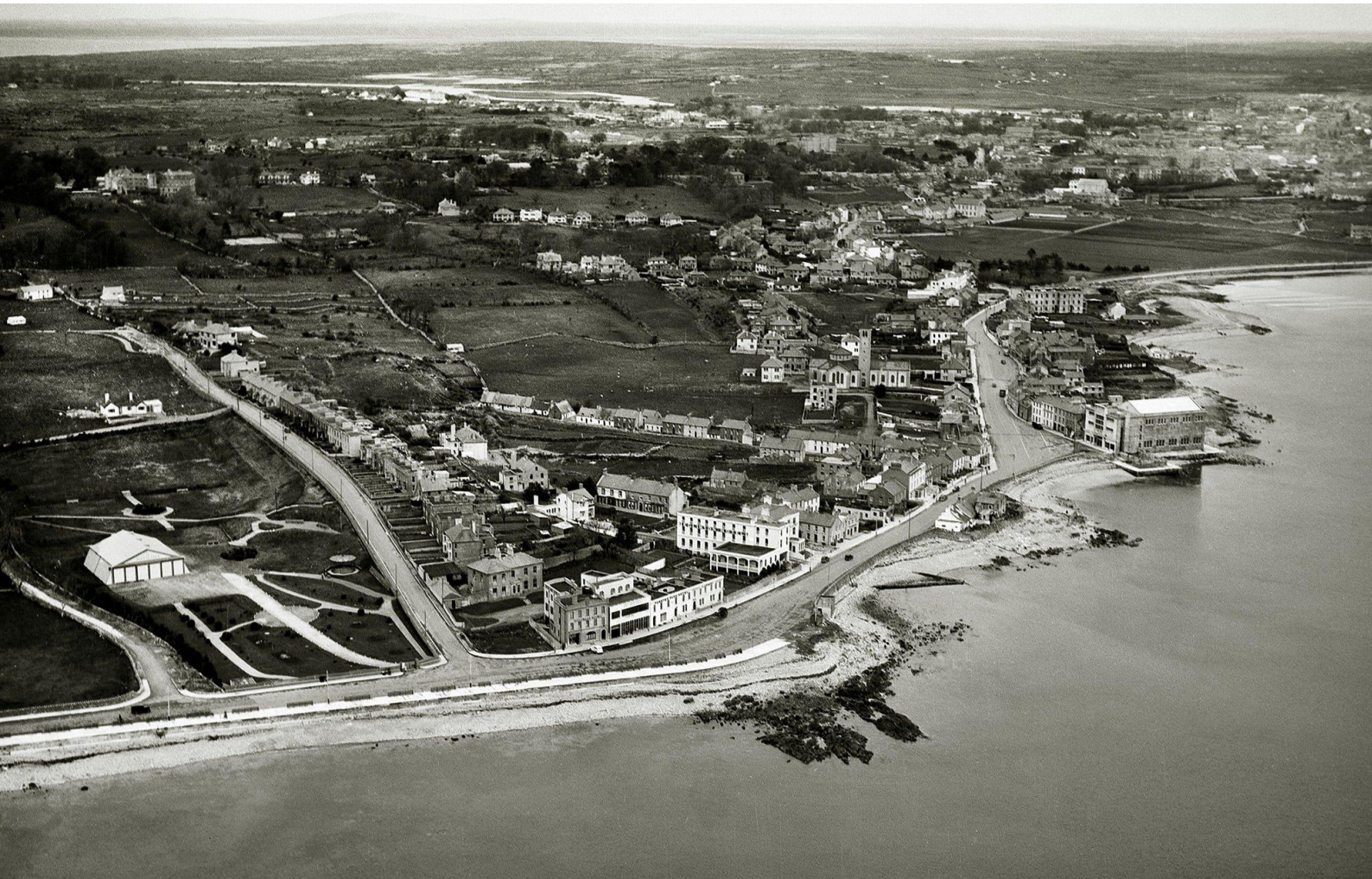
15. A view of Salthill extending from the Hangar and Dalysfort Road to Seapoint, 1953.