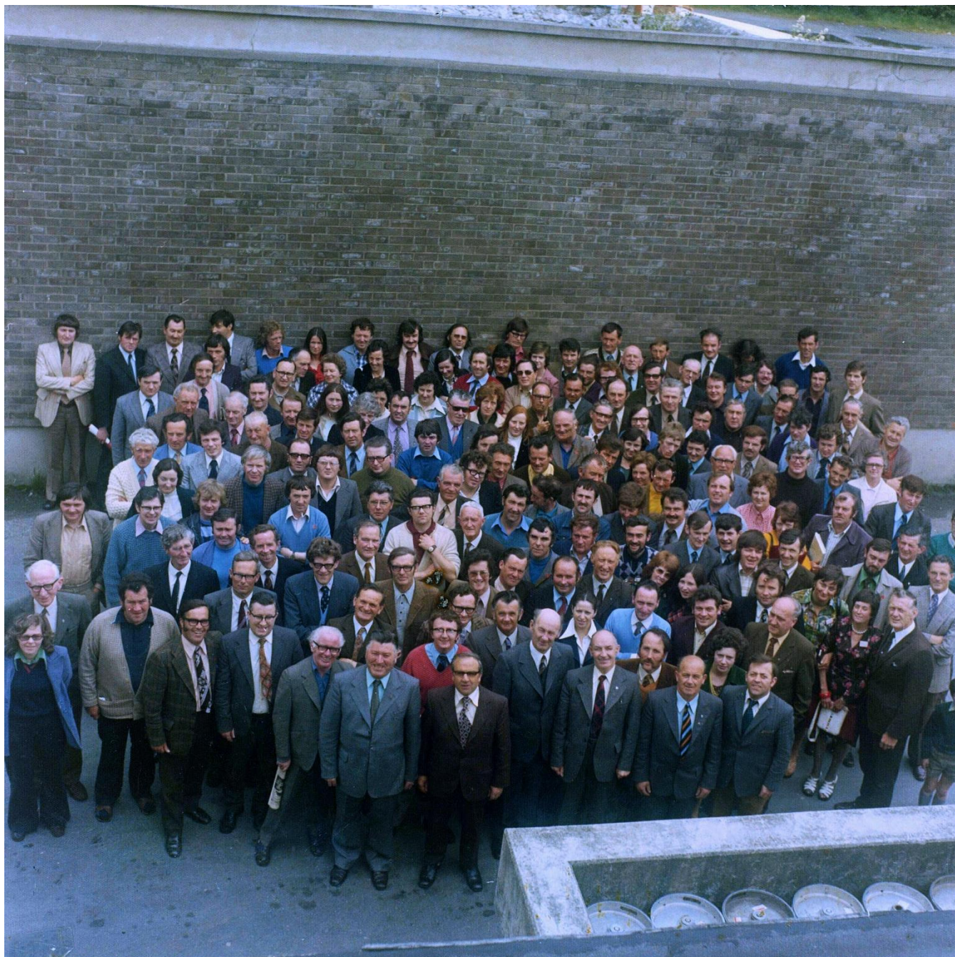
45. A group of Post Office staff. c.1977.