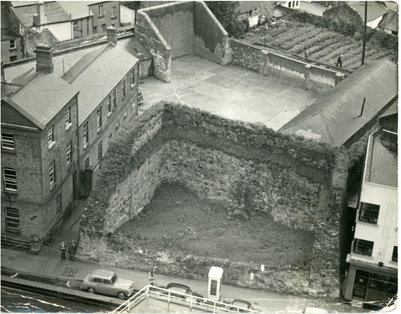
41. The Lion's Tower, 1960.