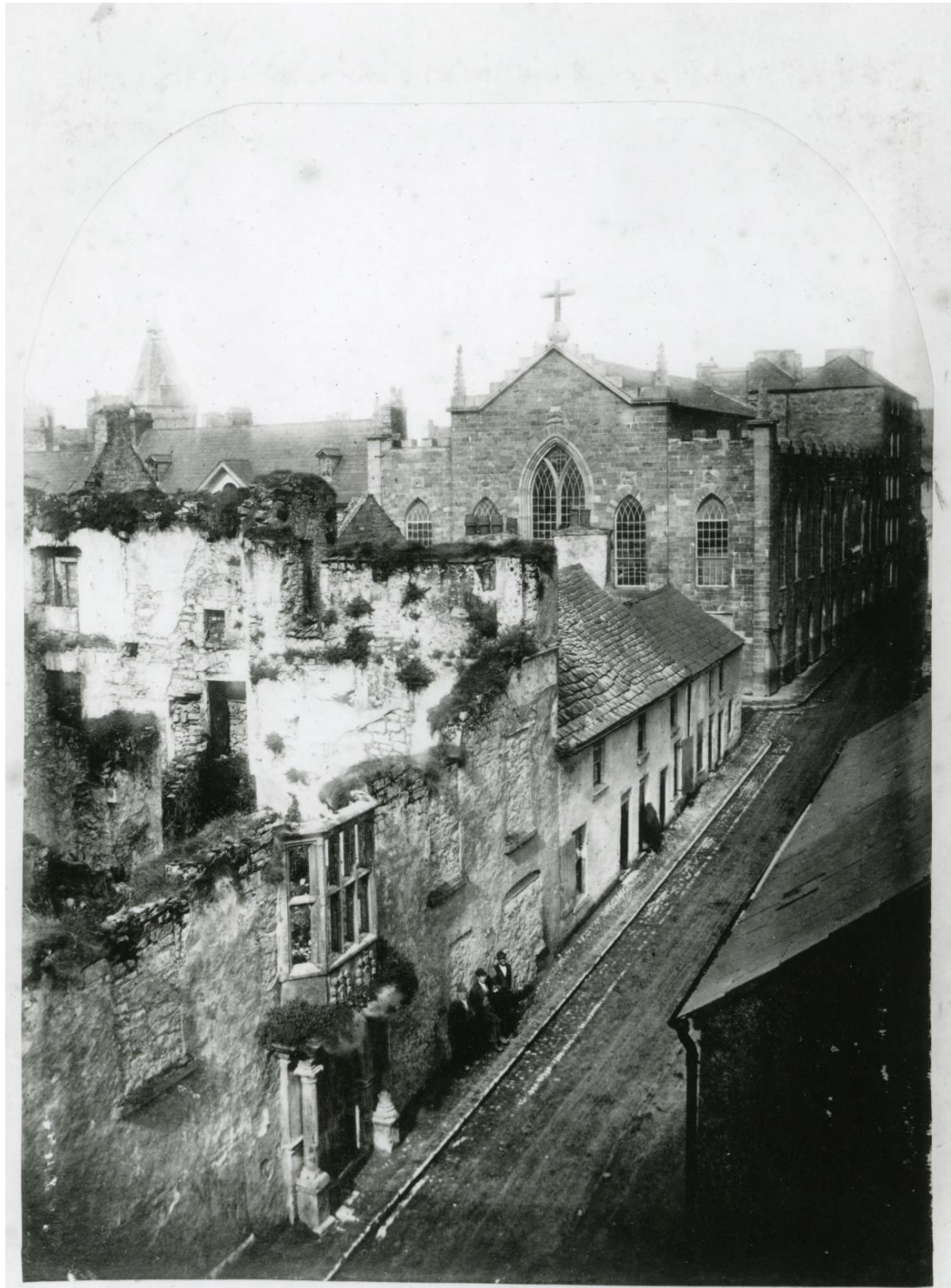
22. Lower Abbeygate Street showing the Browne Doorway in its original setting.