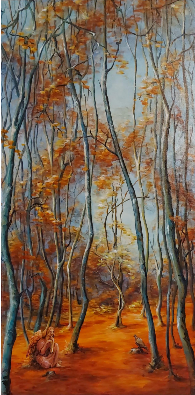
Éadaín Madigan, Enchanted Forest , oil, 40x80cm