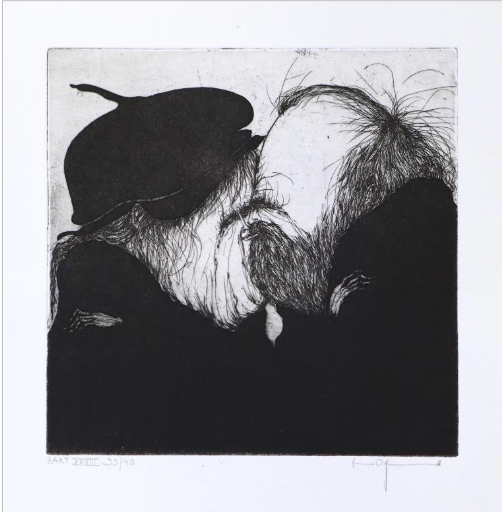
Gertrude Degenhardt, Von Tanten die Trinken und Tanzen (XXVIII) , aquatint etching, 6x6in, 33.40