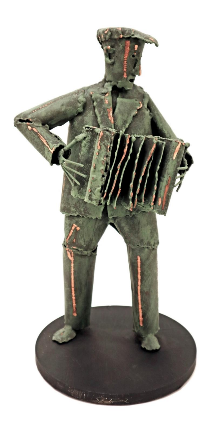
Gay Farrell, Play It Again Sam, Welded Copper, 12x6x6in