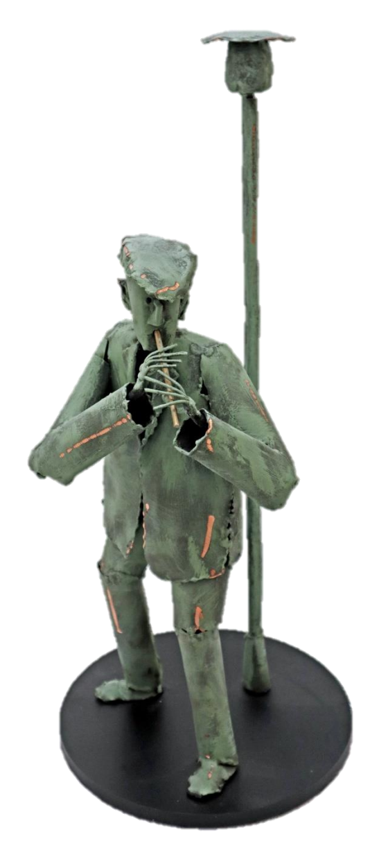
Gay Farrell, Galway Busker, Welded Copper, 18.5x8x8in