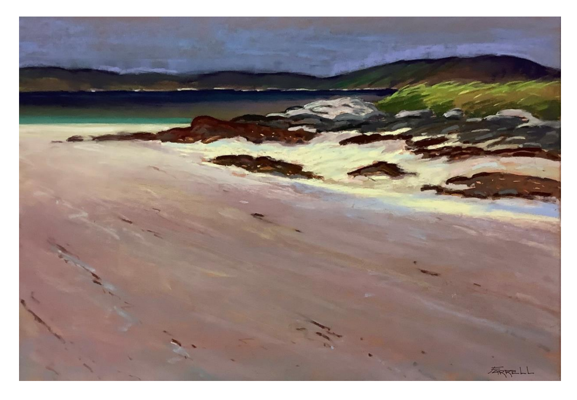
Patsy Farrell, The Silver Strand, Ballyconneely, Pastel, plein-air, 13.5x19in