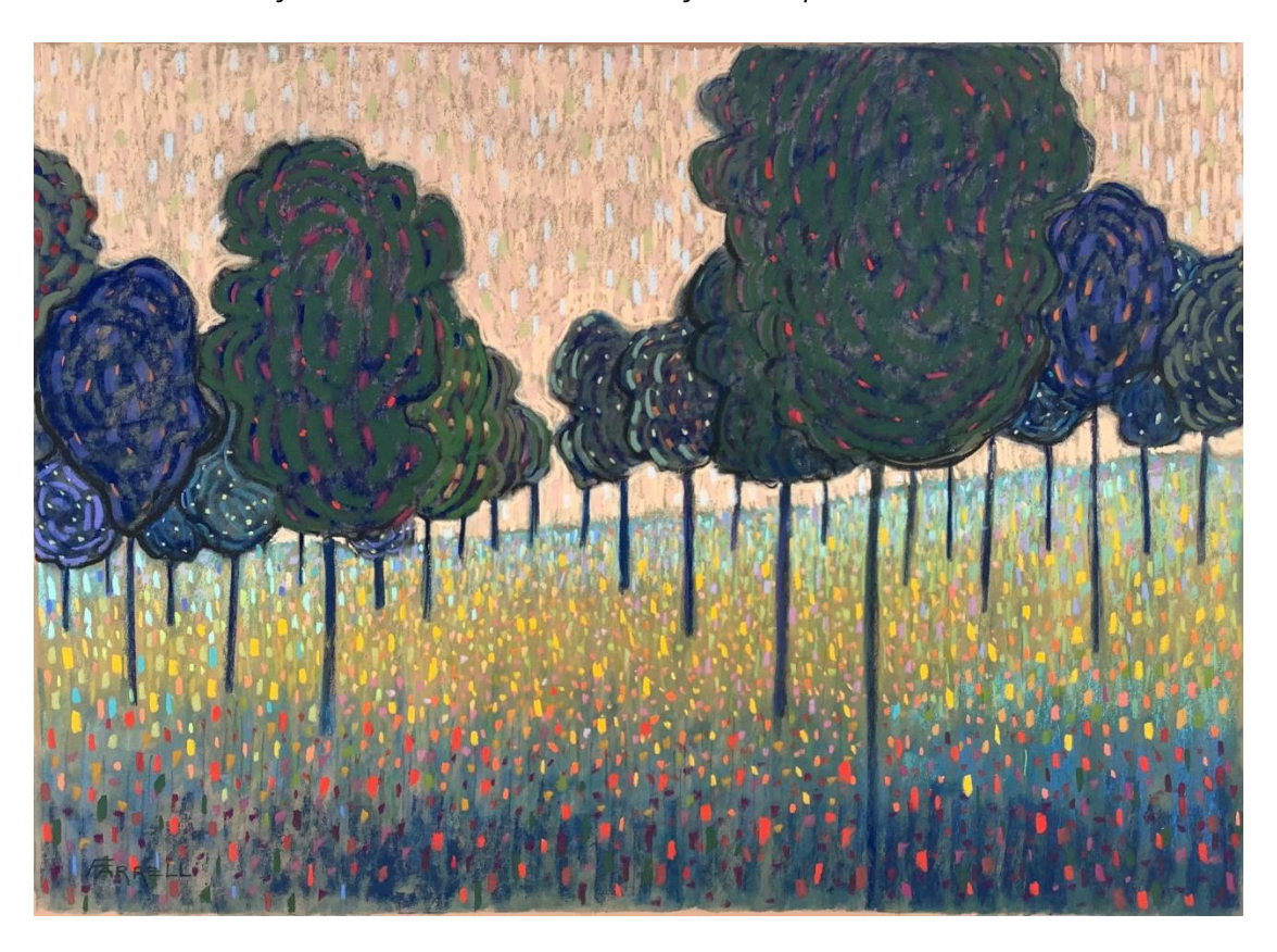
Patsy Farrell, Golden Light, Pastel, 19.5x27in