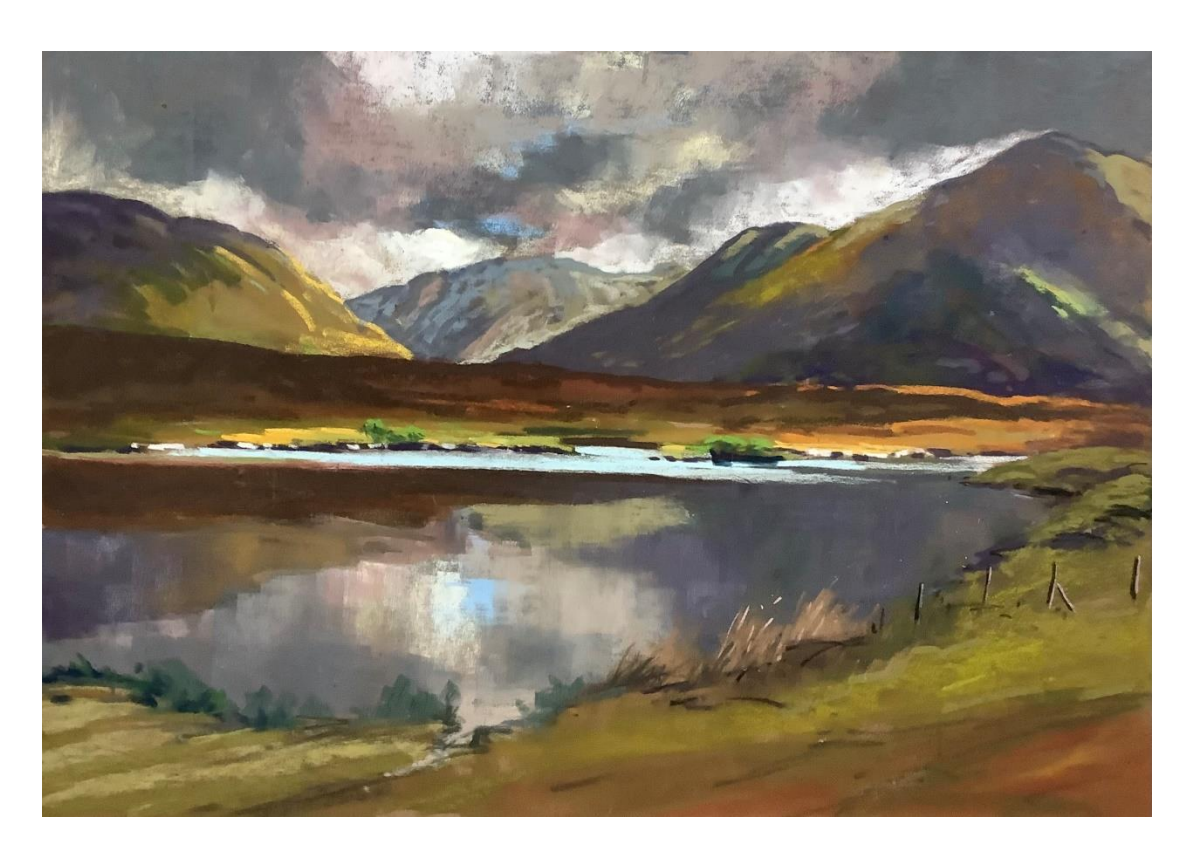
Patsy Farrell, Cloud Burst Over Killary, Pastel, plein-air, 13.5x19in