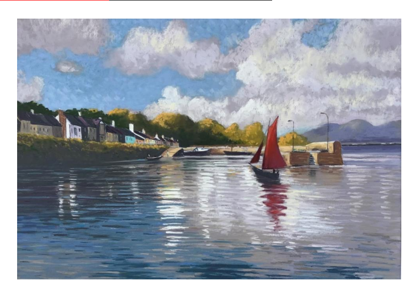
Patsy Farrell, Reflections Roundstone, Pastel, 19x27in