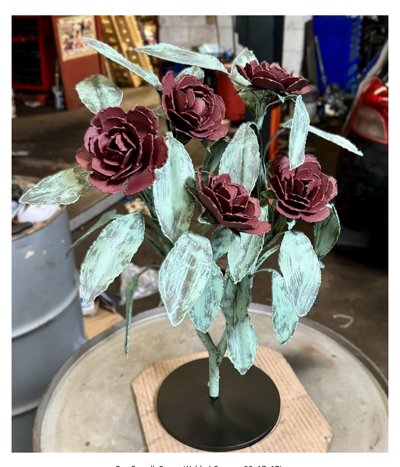
Gay Farrell, Roses, Welded Copper, 22x17x17in