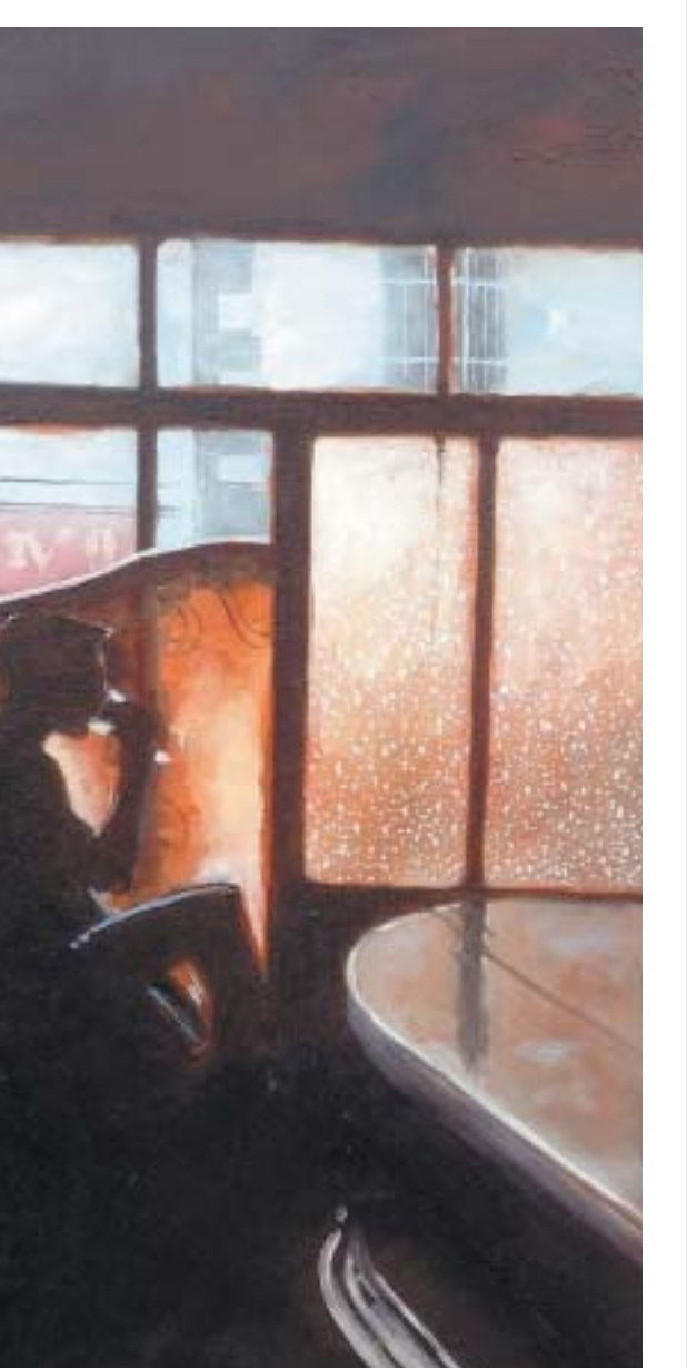
15 The Welcome Pint 24"x18"