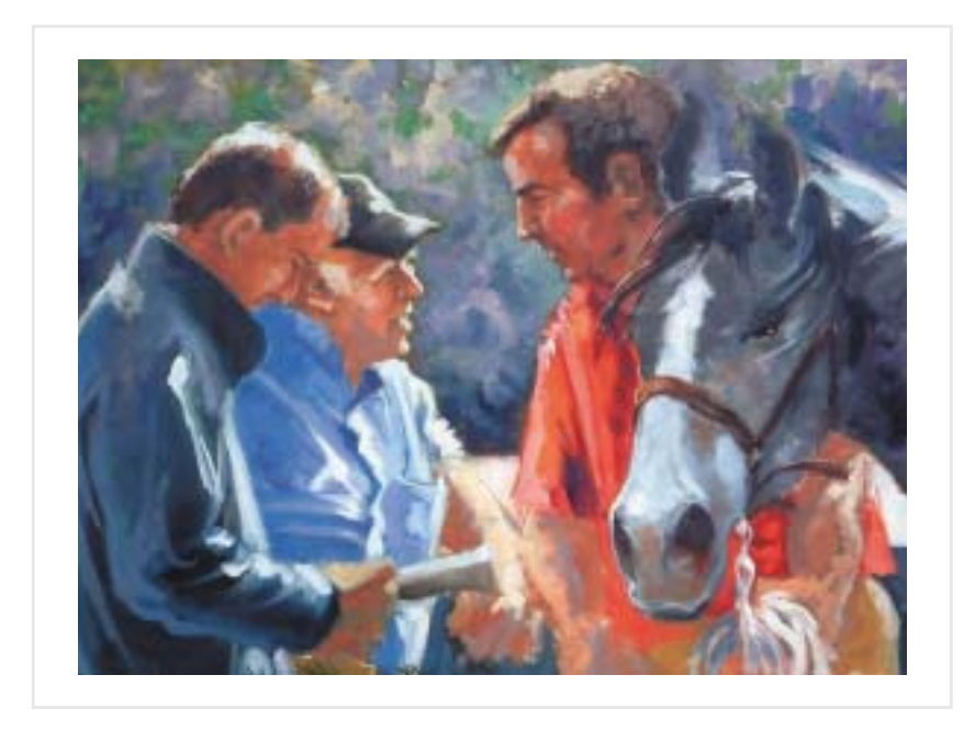
7 Horse Whisperer 24"x36"