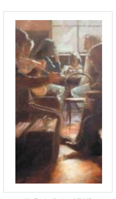
13 Evening Session 24"x18" (Detail)