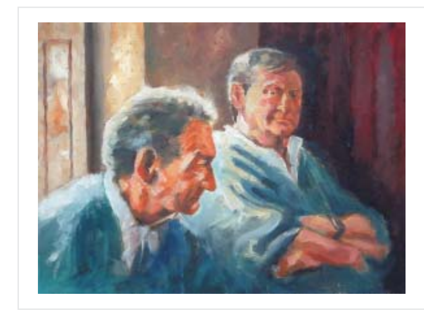
1 Brothers Alone 12"x16"