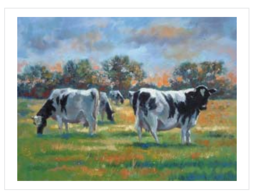
24 Contented Field 14"x18"