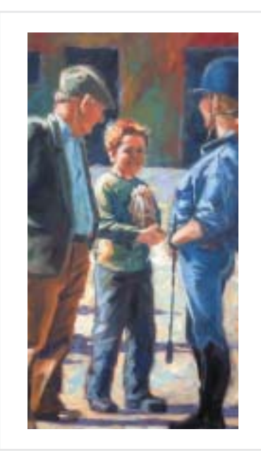
5 When I grow up I want to be Charlie Swann 24"x18" (Detail)