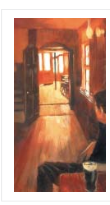
14 Waiting for Friends 16"x12" (Detail)