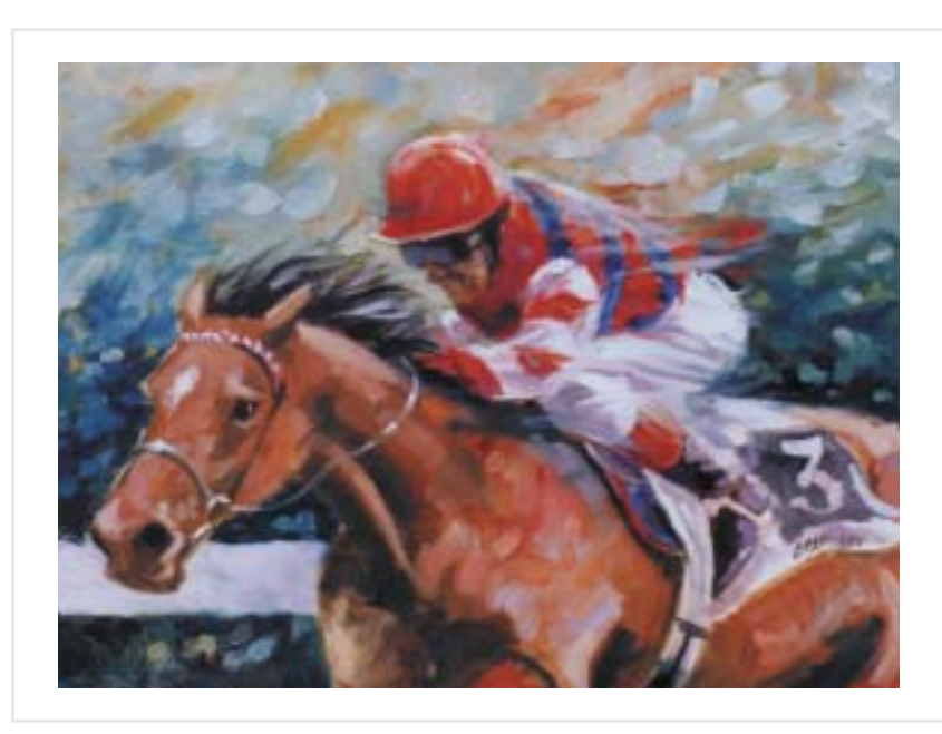
35 Hot Country Road 16"x20" 26 Winning Red Streak 16"x20"